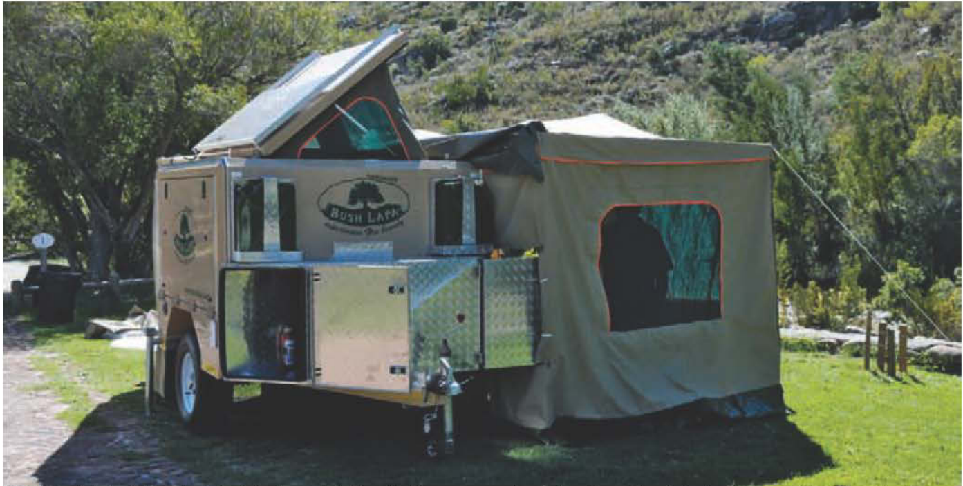
ABOVE Rooimier's solid, tough exterior belies the comfort offered inside. Once everything is setup and secure against the elements it offers great space

and comfort, not to mention shelter from the sun and heat. The optional extra solar panel is a worthwhile investment.