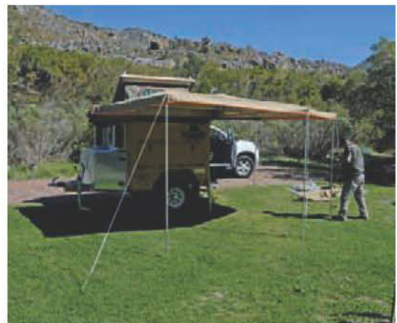
ABOVE The grip-and-twist tent poles work superbly ... but, again, it's best to have a friend to help due to the weight of the tent ceiling.