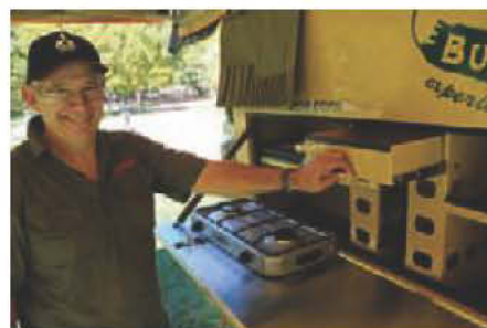
ABOVE There's a pleasant draft that wafts through an open tent door on a hot summer's day. TOP RIGHT The outside kitchen has a large, solid mesh window for views and a touch of ventilation ... and the kitchen itself is well stocked with storage space. BELOW The local inhabitants were interested in our temporary home.

definitely need that extra pair of hands (or two), even just to hold and guide poles and flaps.