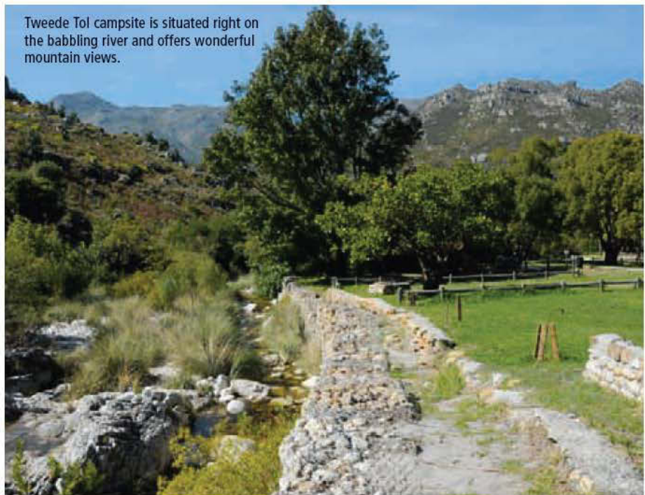
Tweede Tol campsite is situated right on the babbling river and offers wonderful mountain views.

It's difficult to take too much credit here, as towing Roomier with the insane